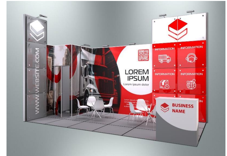
Example of stand with full-color walls design (additional service)