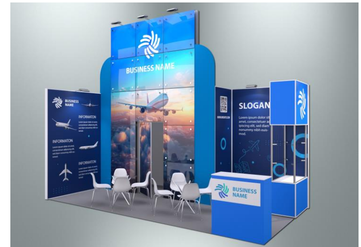
Example of stand with full-color walls design (additional service)