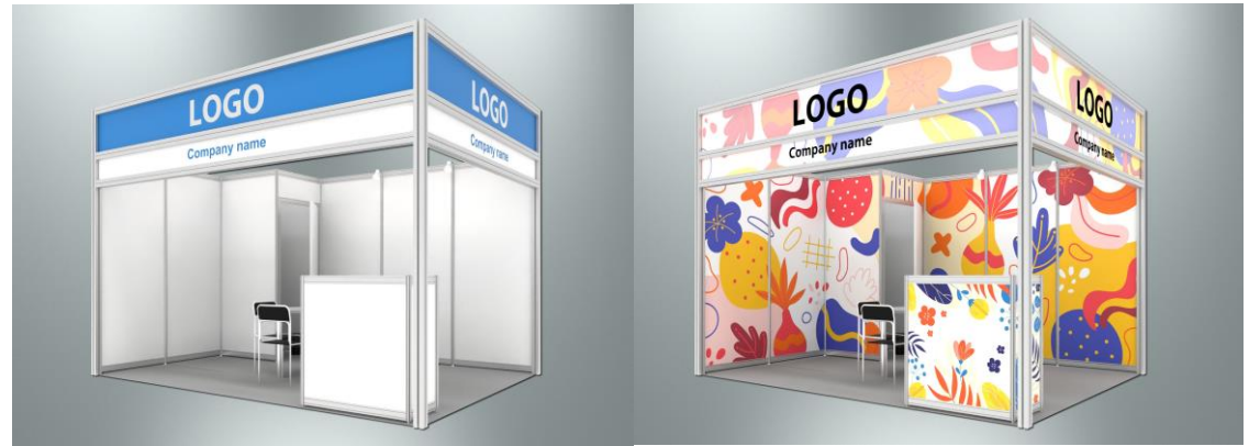
Example of standard stand design

Stand will be located near key exhibitors, what provides best visitor traffic