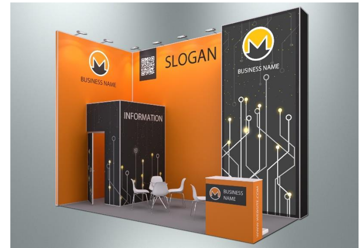
Example of stand with full-color walls design (additional service)