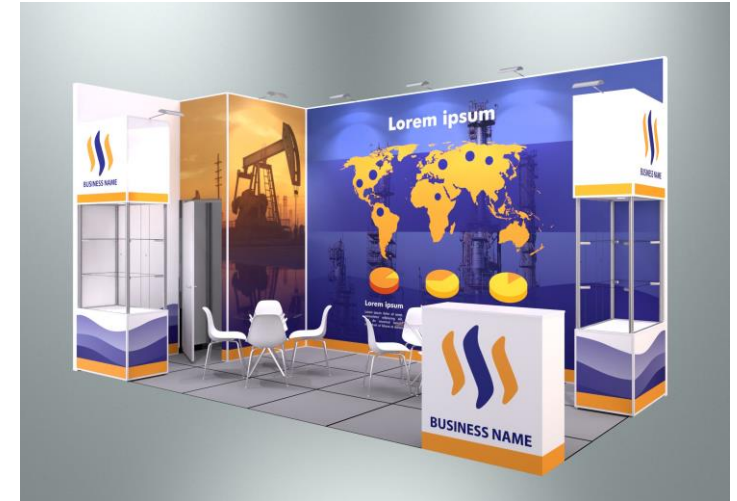
Example of stand with full-color walls design (additional service)