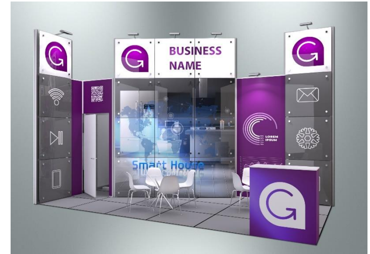
Example of stand with full-color walls design (additional service)