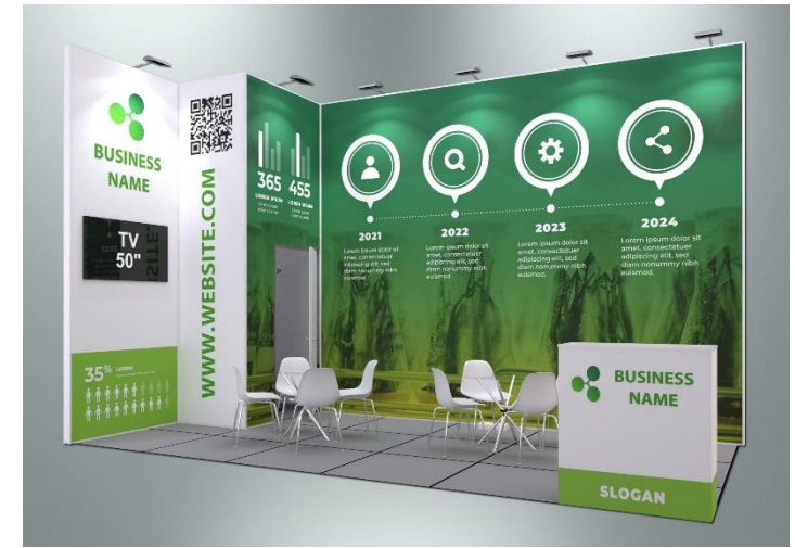
Example of stand with full-color walls design (additional service)