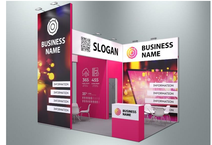
Example of stand with full-color walls design (additional service)