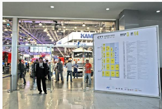
Construction 4x2,8 m