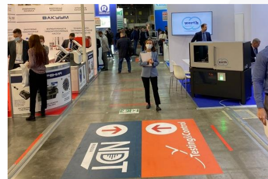
Floor stickers in the exhibition hall