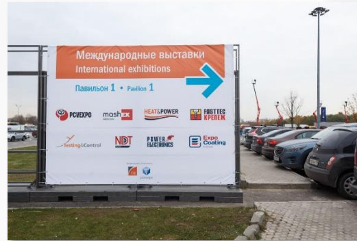
Advertising structure 4x3 m