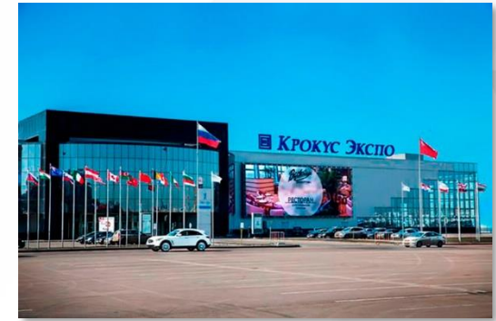
Screens 24x9 m (facade of pav.1)

Two screens (sides "A" and "B") are installed on a 30-meter stele on the territory of Crocus City in the immediate vicinity of the Moscow Ring Road. The commercials are clearly visible from the inside and outside of the highway. The broadcast is carried out simultaneously on two screens.