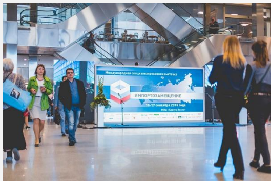
Construction 6x2.8 m