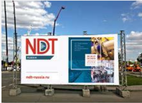
Advertising structure 6x3 m