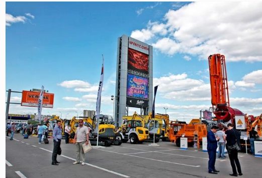
Screens 9.2x6.9 m

Two screens (sides "A" and "B") are installed on a 30-meter stele on the territory of Crocus City in the immediate vicinity of the Moscow Ring Road. The commercials are clearly visible from the inside and outside of the highway. The broadcast is carried out simultaneously on two screens.