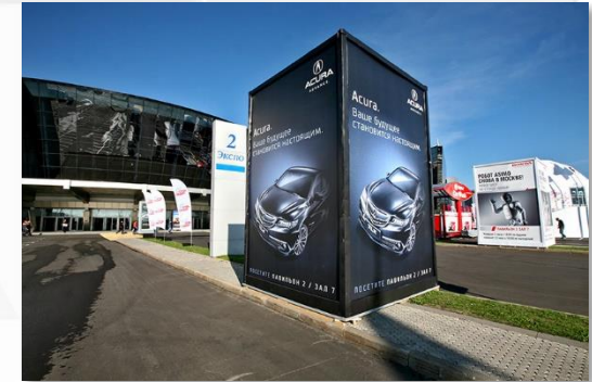
Advertising structure "rectangle" with a side of 2x3 m