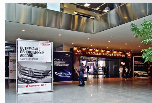
Construction 2x2,9 m