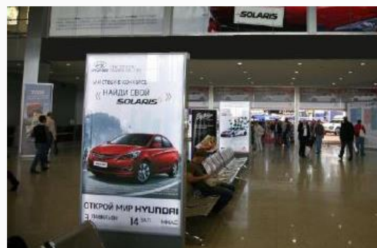
Lightboxes, 1.17x1.97 m On the photo: side A (towards the exhibition halls)