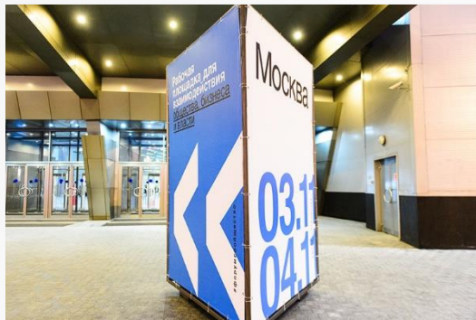
Advertising structure "triangle" with a side of 2x3 m